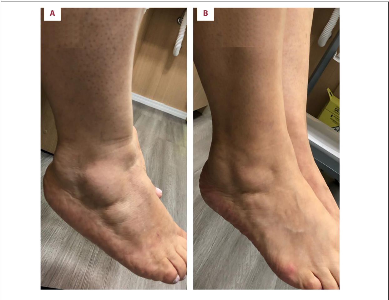
Figure 3. Decrease in painful fat nodules in the lateral malleolus in a patient with stage 1 lipedema. (A) Before. (B) After.