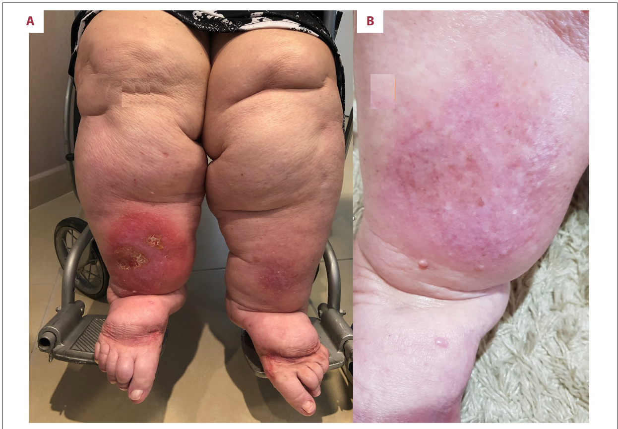
Figure 7. Patient with lipolymphedema, stage 4 lipedema, with erysipelas that was difficult to treat before (A) and after (B) non-surgical treatment for lipedema.

experienced volumetric, symptomatic, and aesthetic improvements. In the second case, symptoms and fat nodules showed significant improvement. In the third case, in addition to the symptomatic improvement, there was significant volume loss. In the fourth patient, who had grade I obesity on the basis of BMI, there was disproportion and substantial fat deposition in the lower limbs. In this case, lipedema mimicked obesity; nevertheless, there was significant volumetric decrease in addition to symptomatic improvement. In the fifth case, the initial objective was the treatment of refractory erysipelas; nevertheless, clinical treatment facilitated the resolution of the persistent infection.