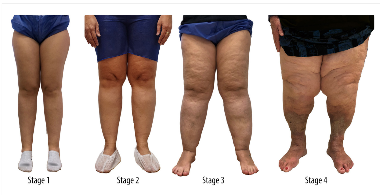
Figure 1. Classification of lipedema by evolutionary stages [21]. Stage 1: normal skin with an enlarged hypodermis; Stage 2: unevenness of the skin texture with pleats of fat and large piles of tissue growing like unencapsulated masses; Stage 3: hardening and thickening of the subcutaneous with large nodules and protrusion of cushions/accumulations of fat, especially in the thighs and around the knees; Stage 4: lipedema with lymphedema, so-called lipolymphedema.

Stage I lipedema is characterized by normal skin with enlarged hypodermis. Stage II is defined as uneven skin texture with pleats of fat and large piles of tissue growing like unencapsulated masses. Stage III is characterized by hardening and thickening of the subcutaneous tissue with large nodules and protrusion of cushions/accumulations of fat, especially in the thighs and around the knees. Finally, stage IV is associated with lymphedema, and is also called lipolymphedema.