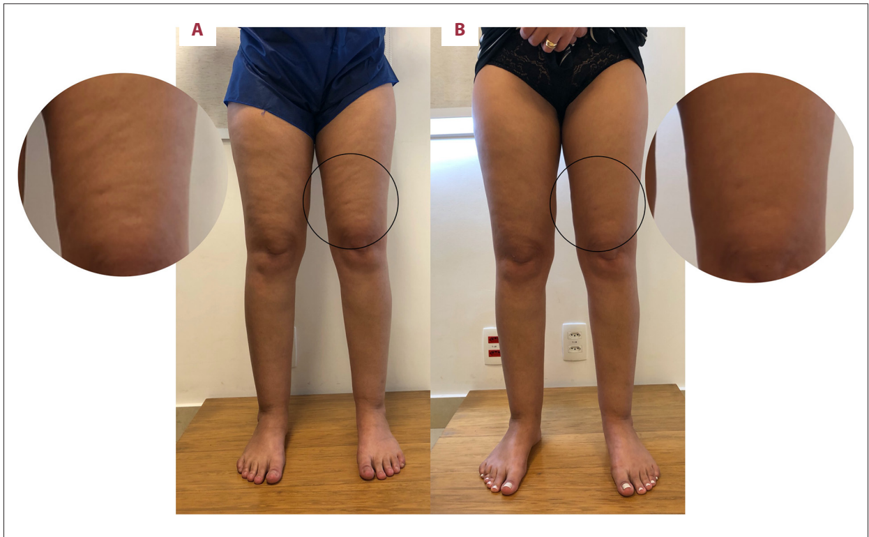
Figure 2. Patient with stage 1 lipedema before (A) and after (B) treatment, showing significant aesthetic improvement of gynecoid lipodystrophy (cellulitis), although it was not the main objective of the treatment.