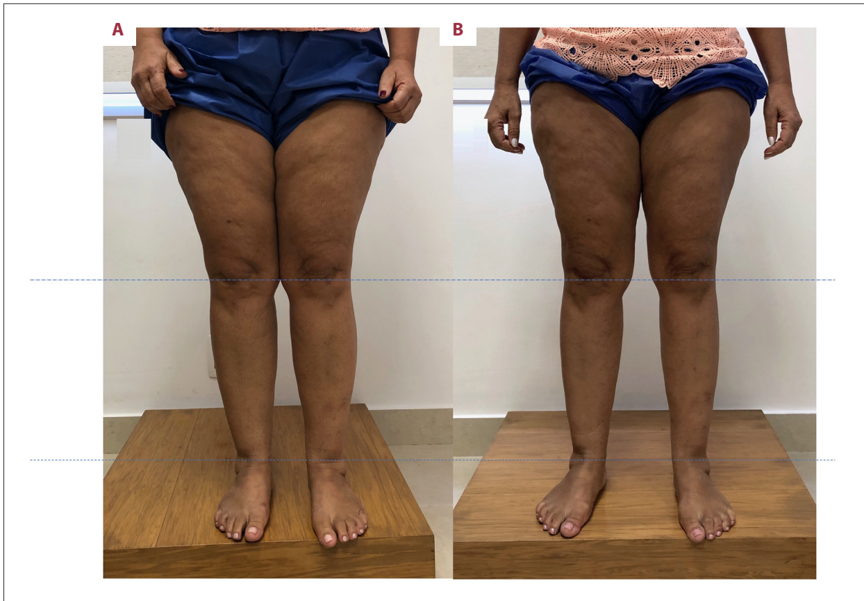
Figure 4. Patient with stage 2 lipedema (A), showing a slight improvement and decrease in fat deposition in the lower limbs (B).

Physical examination revealed absence of Godet and Stemmer signs, deposition of fat that was tender to palpation in the lower limbs, and 115 points on the QuASiL. EDCV-MMII revealed small varicosities in the thighs and legs, without significant reflux, with a measured dermal thickness of 22.4 mm and 21.2 mm in the right and left pre-tibial regions, respectively.